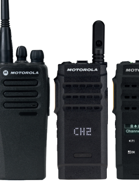
MOTOTRBO SL1600 MOTOTRBO DP1400