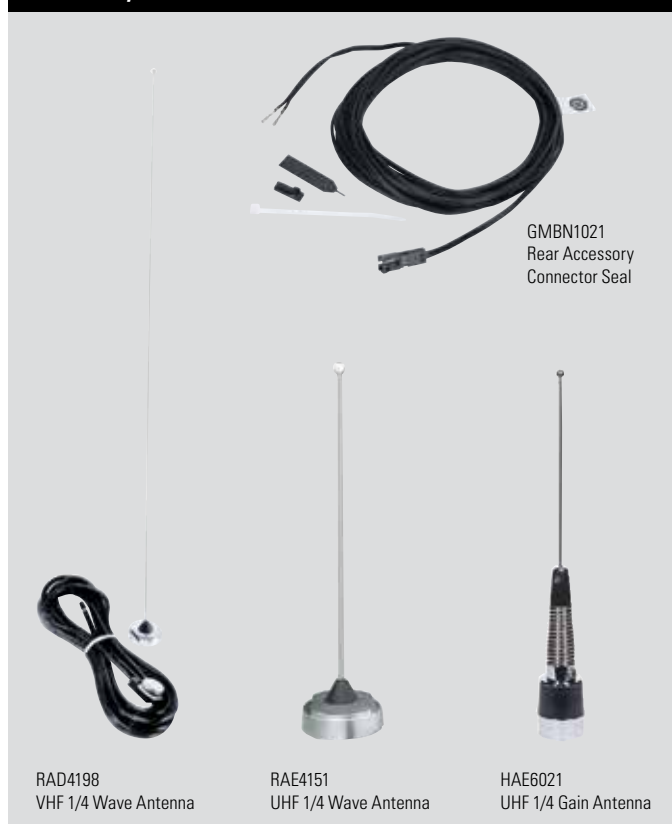
RAD4198 VHF 1/4 Wave Antenna